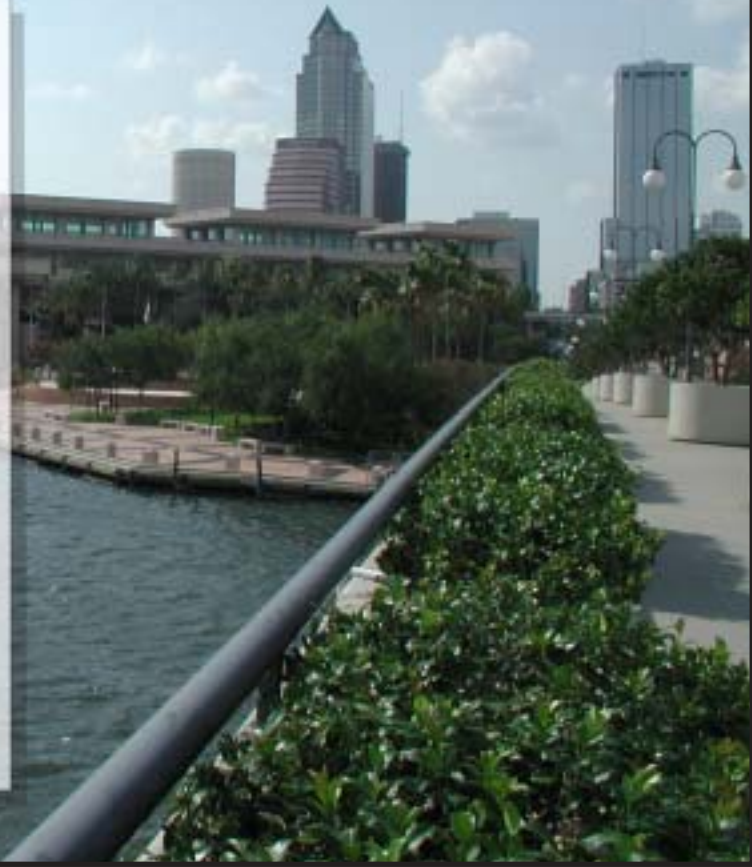
View of Tampa Convention Center and Downtown