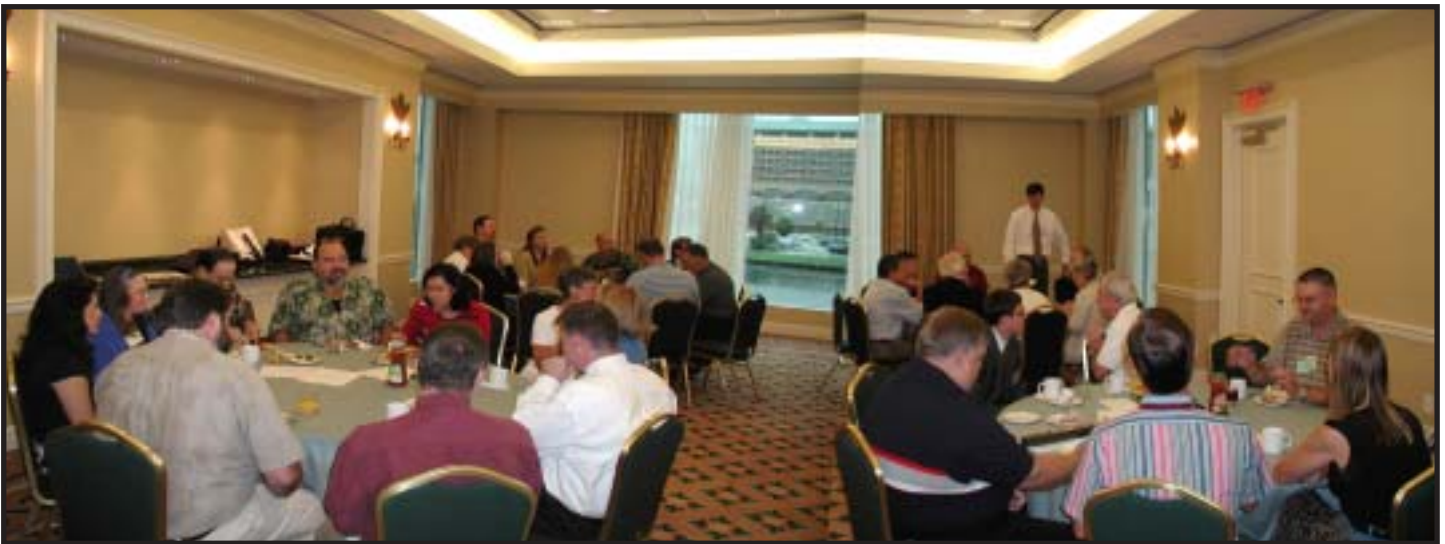
STC-LAC Breakfast, Tampa