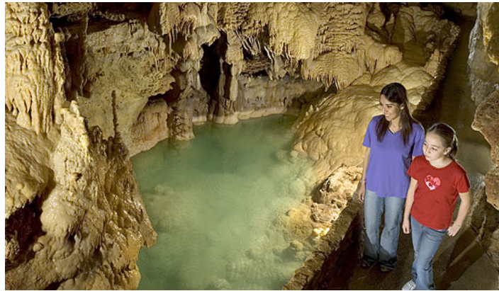
Natural Bridge Caverns – open 9am to 4pm