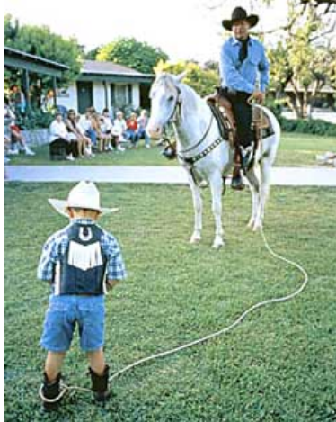
Bandera – Cowboy for a day: http://www.banderacowboycapital.com/