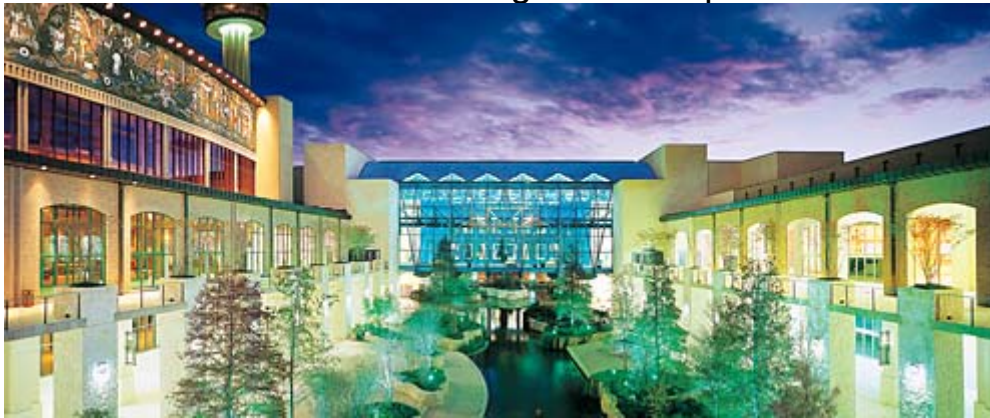
Henry B. Gonzalez Convention Center

All committee meetings will take place at