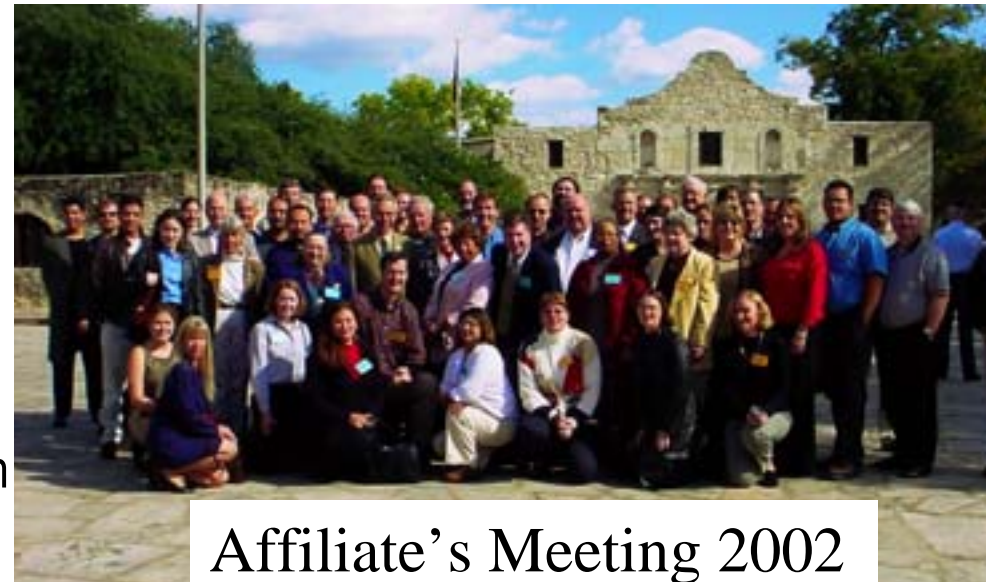
Affiliate's Meeting 2002