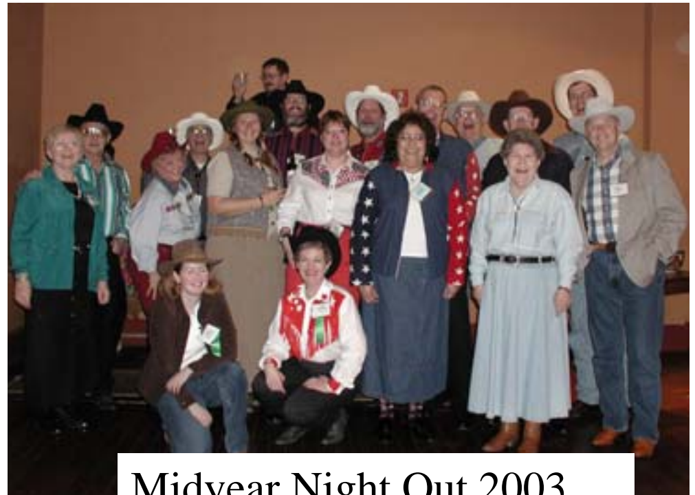
Midyear Night Out 2003