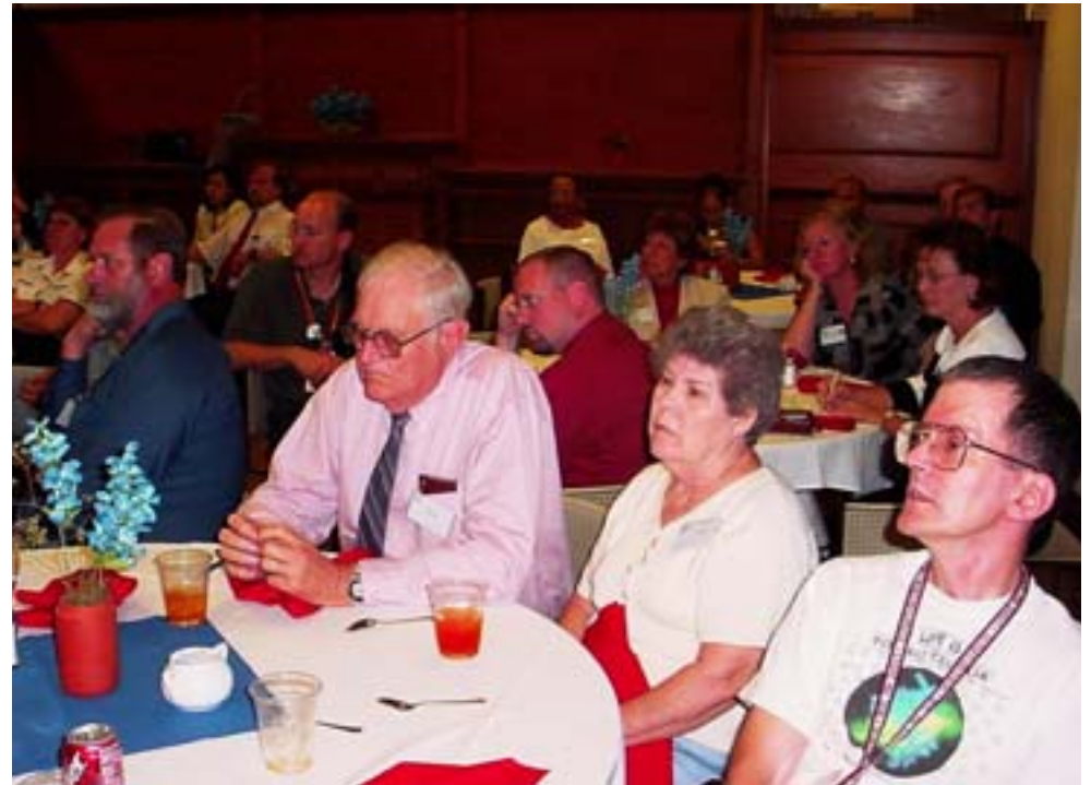
August 2002 Austin TX Meeting